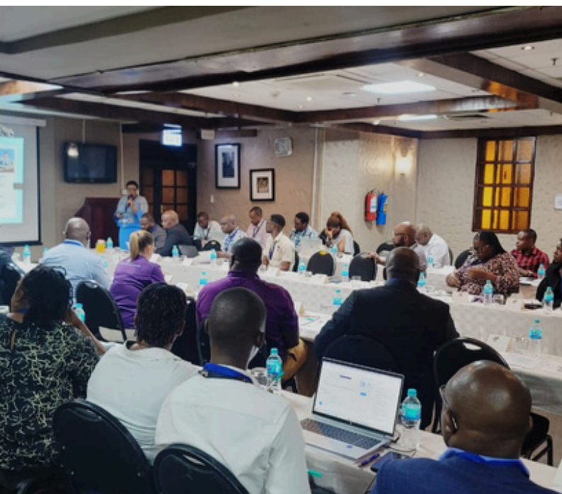
OPHID hosted another C-Suite Knowledge Exchange Workshop under the themes: Role of C-Suite in Audit Readiness, Common Audit Findings and Solutions and Audit experiences.