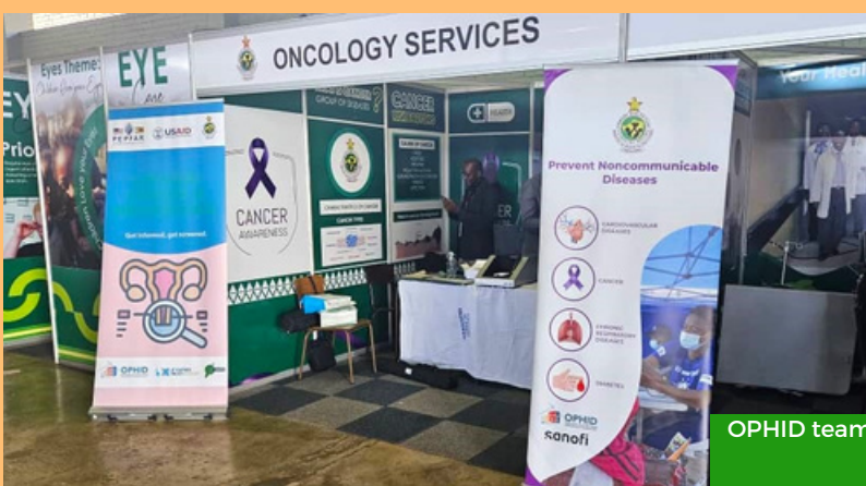
OPHID team and MoHCC executives at the MoHCC cervical cancer screening point ZAS 2024