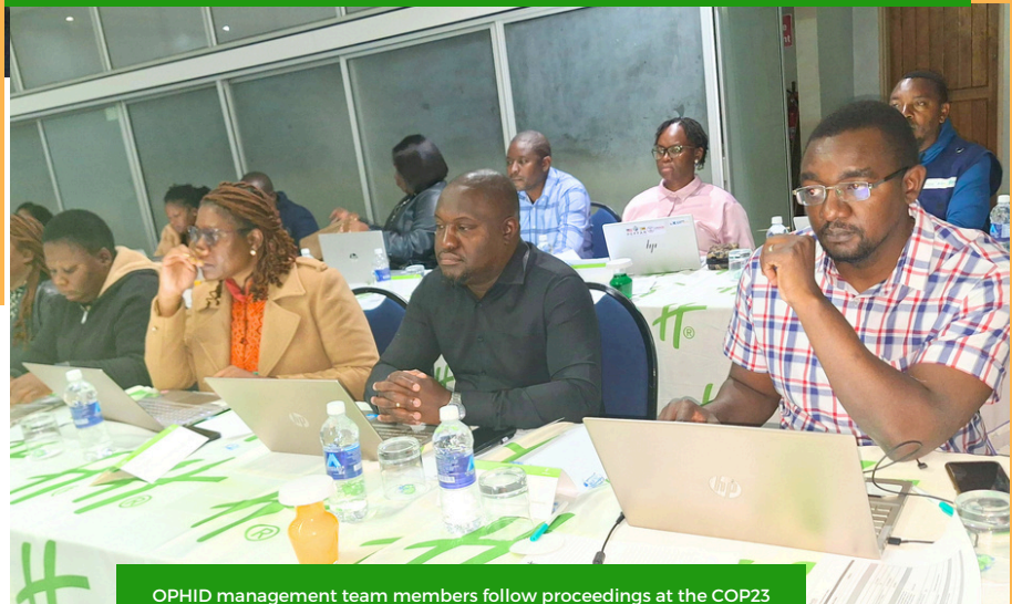
OPHID management team members follow proceedings at the COP23 Y2 Planning meeting in Bulawayo.