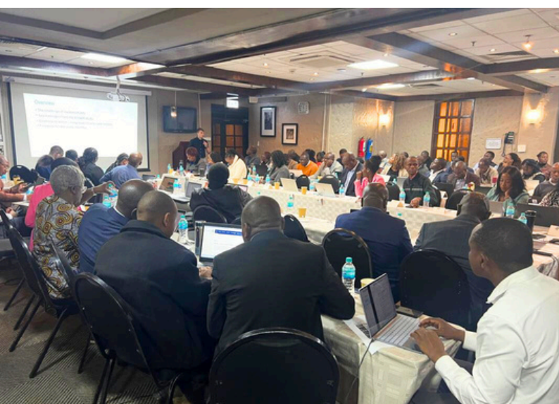
OPHID and London School of Hygiene & Tropical Medicine shared findings from our KnowM study exploring health system readiness to provide 'whole person' care for Zimbabweans living with multimorbidities.