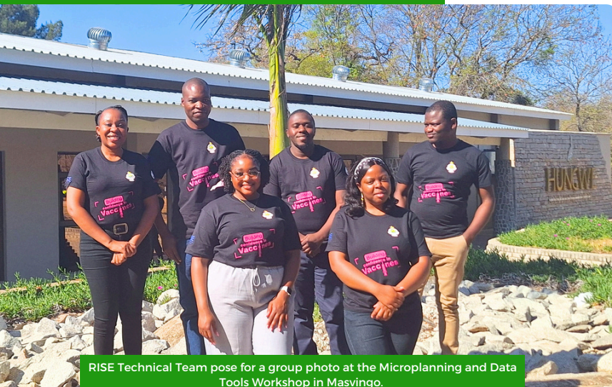
RISE Technical Team pose for a group photo at the Microplanning and Data Tools Workshop in Masvingo.

During the workshop, participants were divided into groups to identify COVID-19 misinformation sources, evaluate strategies for addressing misinformation, design communication materials for priority groups, identify modern communication technologies, and co-design IEC materials for Mpox and strategies for managing information gaps, all within the Zimbabwean context.