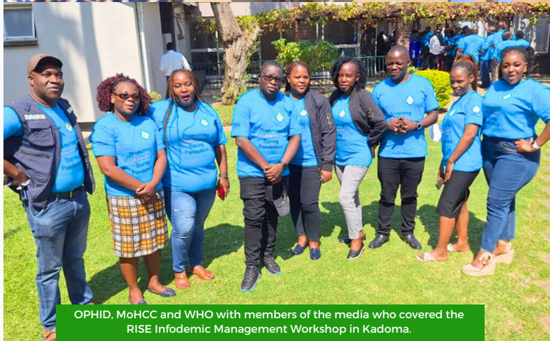
OPHID, MoHCC and WHO with members of the media who covered the RISE Infodemic Management Workshop in Kadoma.